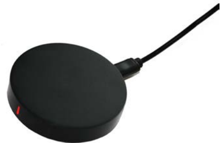
PATBOX charging base